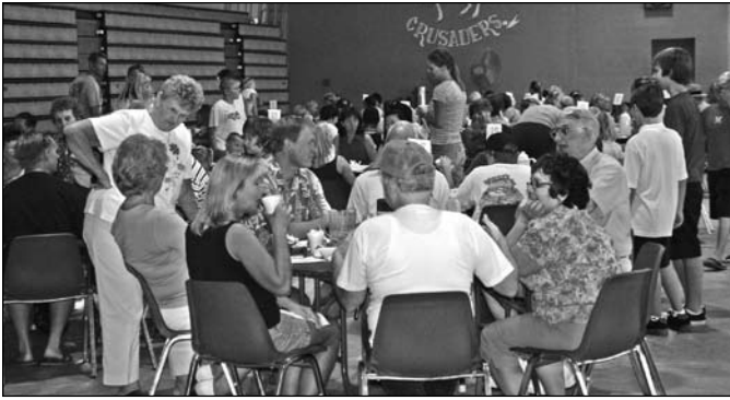
A large crowd of grandparents, parents, and students enjoyed the great food and fellowship at the annual Labor Day Pancake Breakfast.