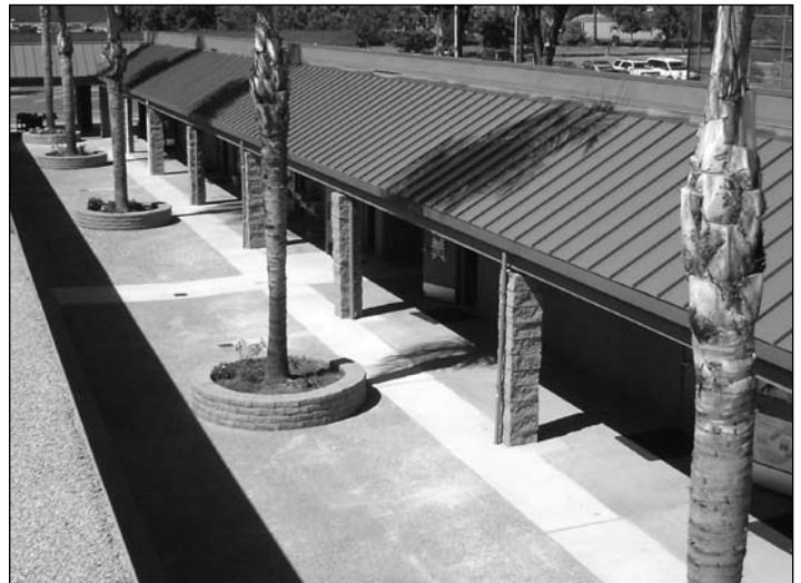
Summer construction project: The remodeled eaves at the elementary school improves appearances and removes a safety concern.

God continues to bless Calvin in many ways, and we are grateful for the hard work and giving at the Dutch Festival and the Fall Drive that continue to raise funds to make our campus safe and attractive.